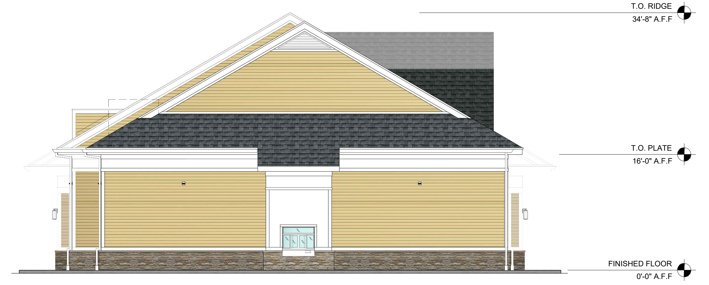
LEFT ELEVATION NTS B