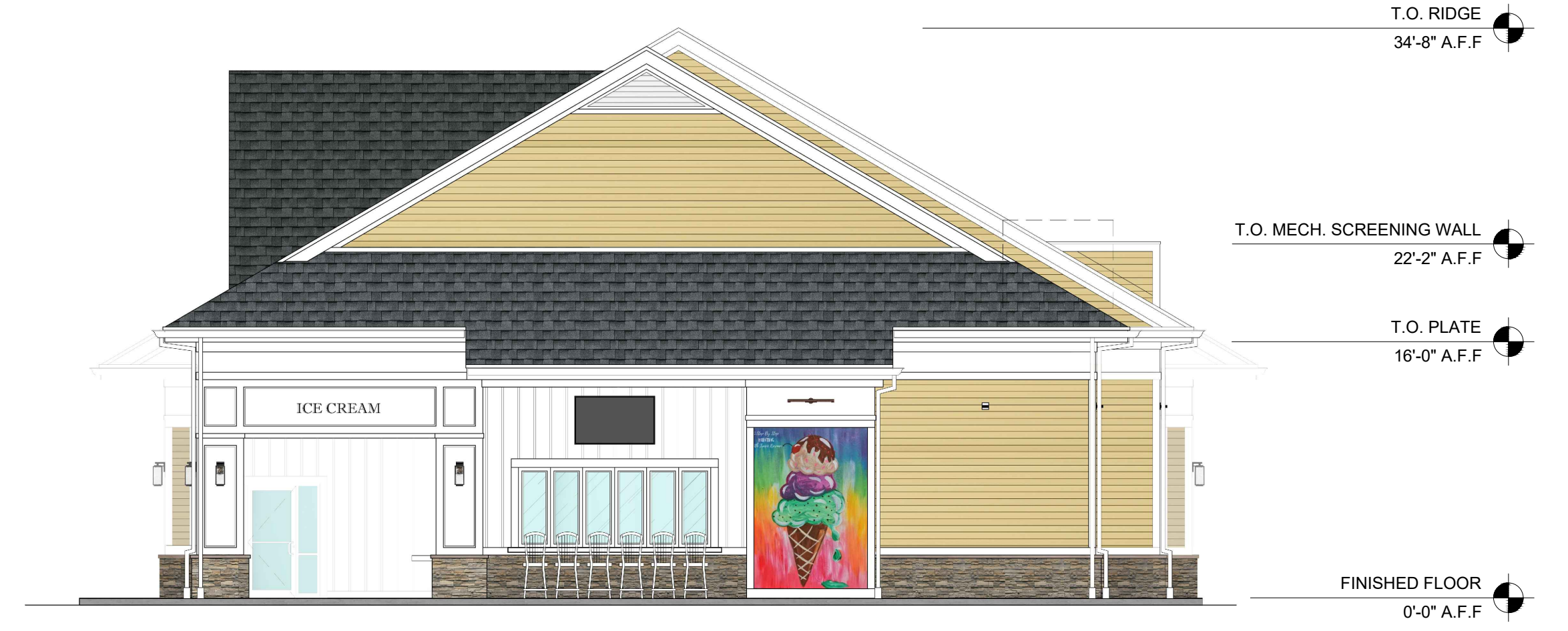
RIGHT ELEVATION NTS C