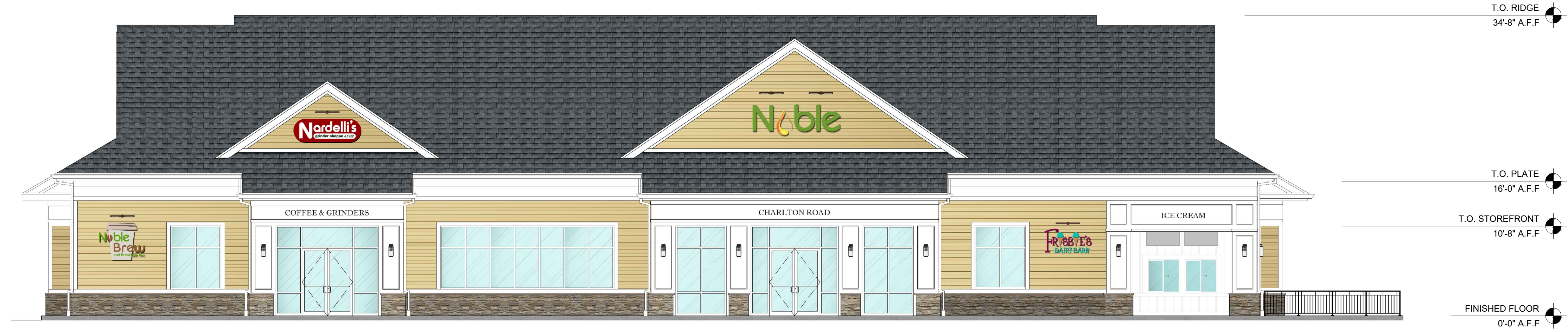
FRONT ELEVATION NTS A