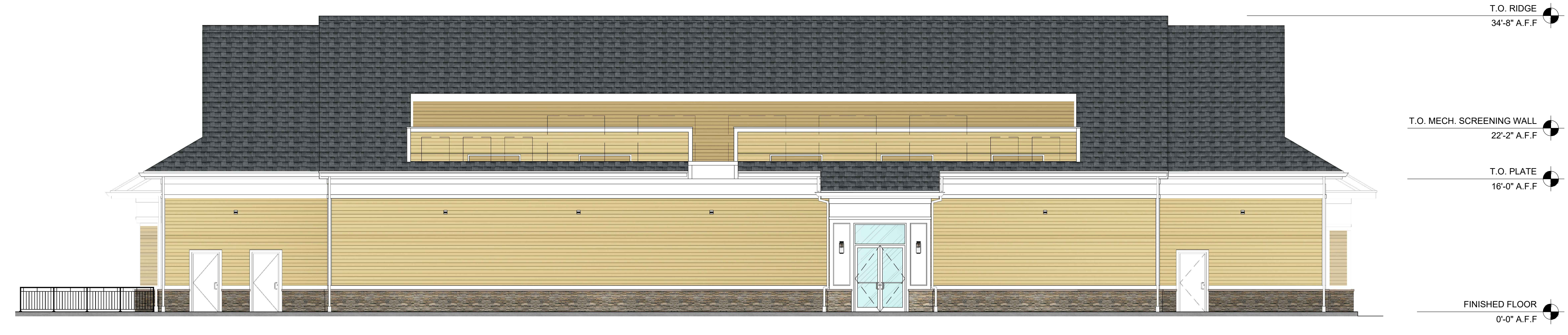
REAR ELEVATION NTS D