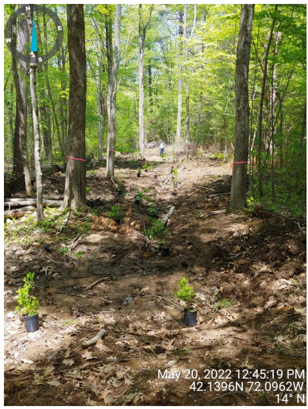
4. Wetland plant layout