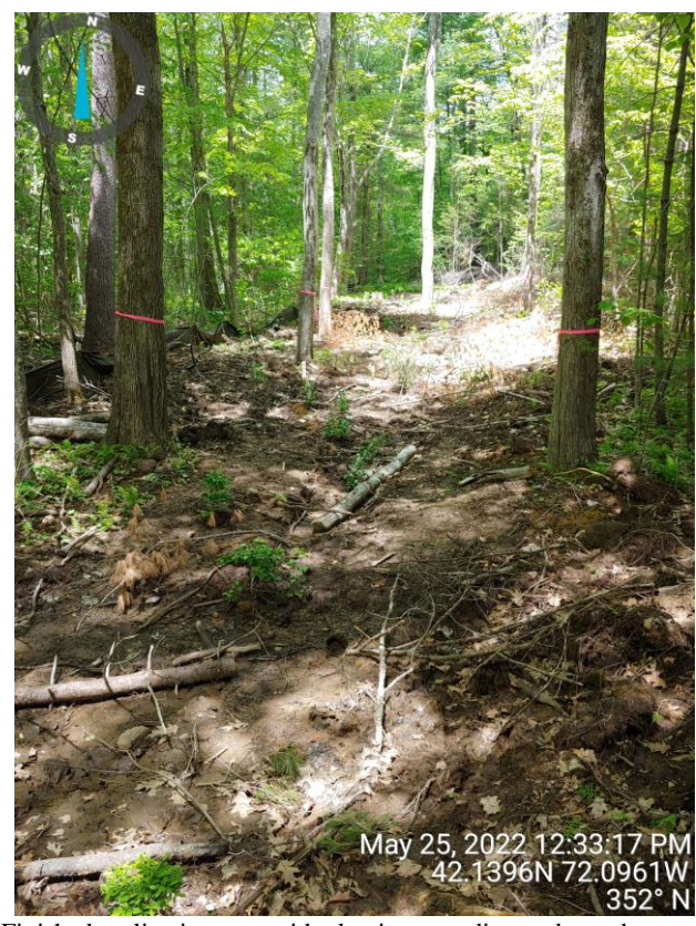
5. Finished replication area with plantings, seeding and woody material