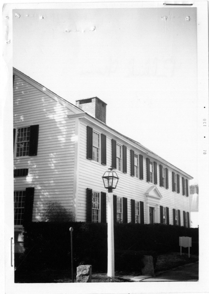
North facade, main building. 10/24/70