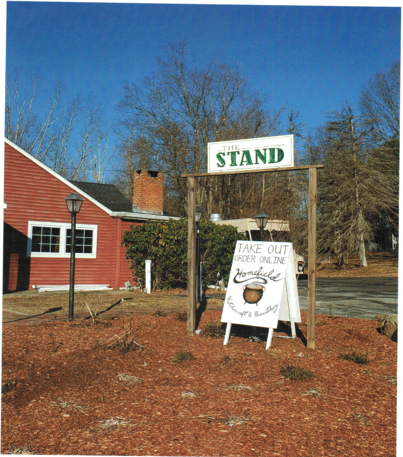
– EXISTING HOMEFIELD SIGN, WEST ELEVATION –