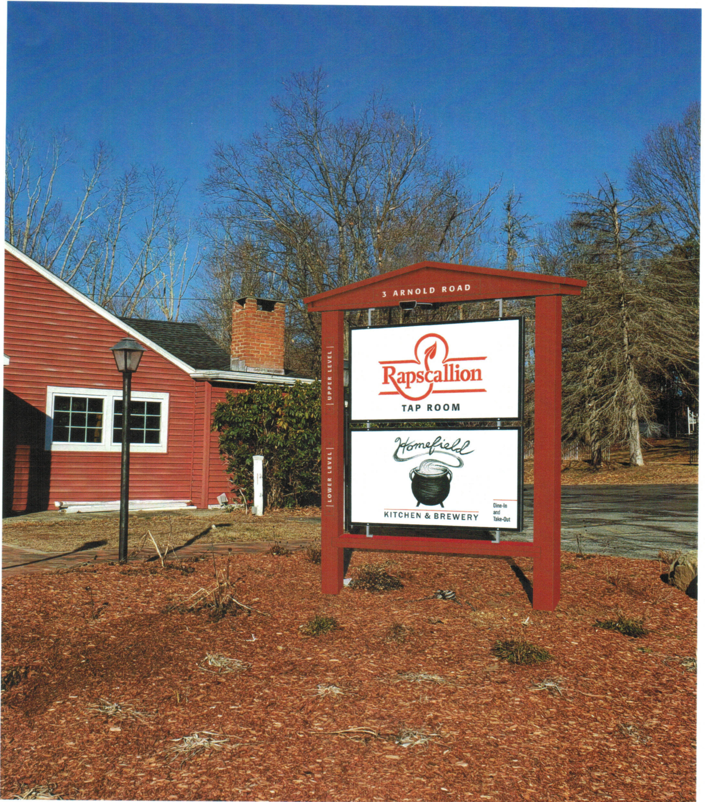
– PROPOSED RAPSCALLION and HOMEFIELD SIGN, WEST ELEVATION –