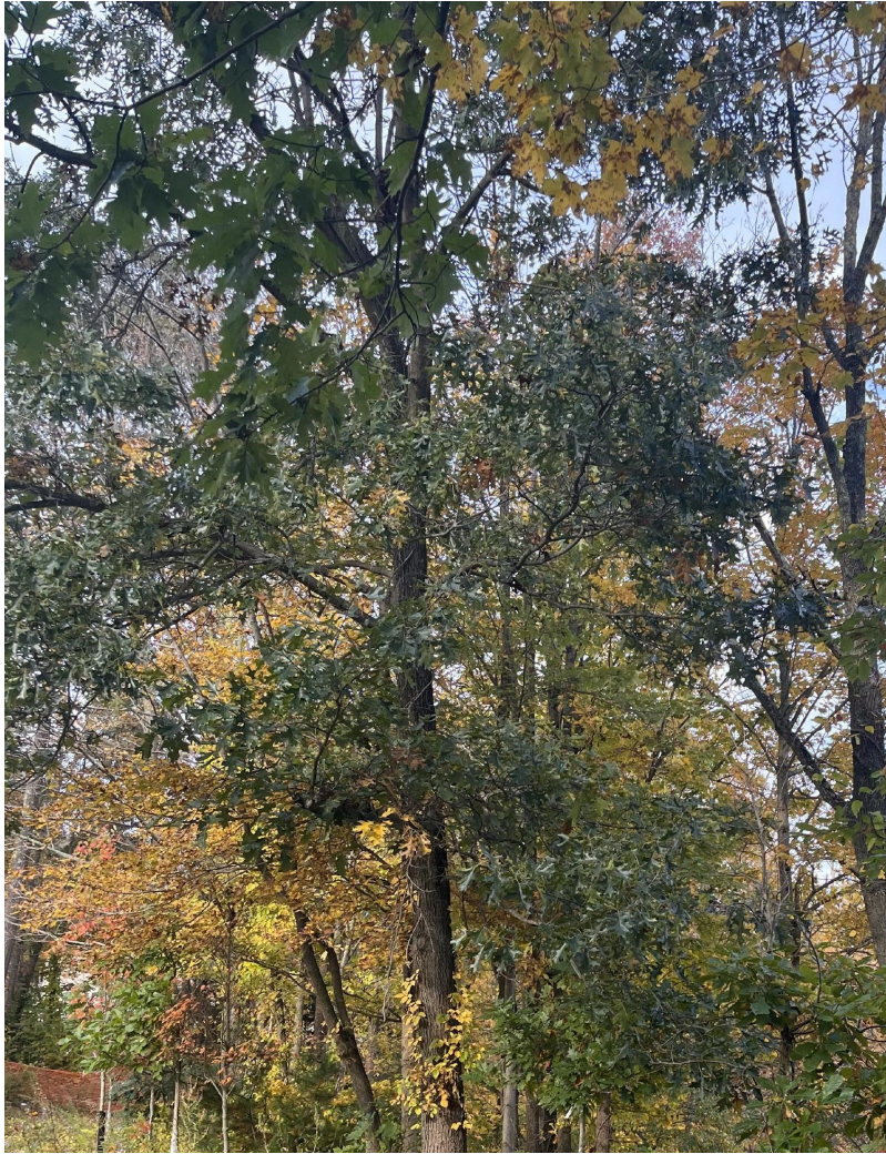
Photo 3 taken by Richard Connelly on 10/6/2023 – 23 saplings were planted on 5/21/2021, as required by the Commission. The photo shows a typical example of the vigor of all of the saplings.