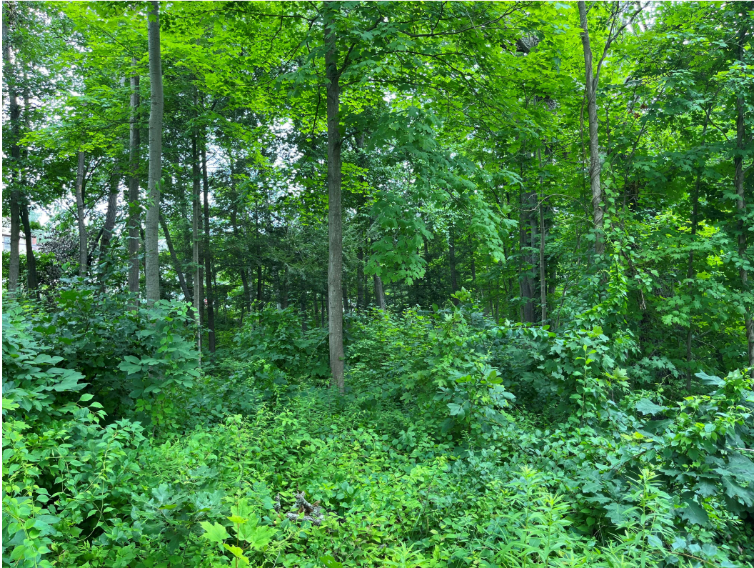
Photo 4 taken by EBT, Inc. on 7/16/2022 – Standing on the eastern property boundary of 9 Holland Road looking into the Blackinton LLC (595 Main Street) property where the forest undergrowth saplings and bushes have grown back from the original violation cutting, which occurred in 2019.