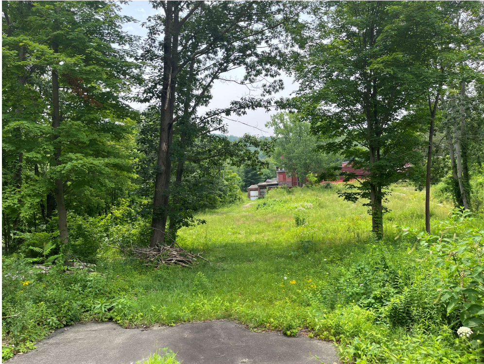
Photo 1 taken by EBT, Inc. on 7/19/2023 – Looking west showing the stable entrance off of Route 20 downgradient of DOTs twin catch basins (the subject of stormwater overflow). The applicant has been keeping the catch basin grates clear of debris so Route 20’s stormwater does not flush through 9 Holland and cause sedimentation into the Quinebaug River (as had been occurring prior to EBT, Inc’s involvement in the project in 2019).