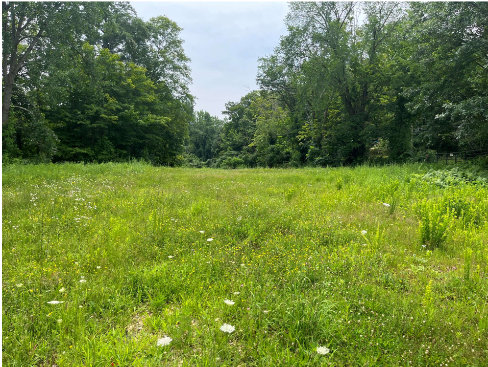
Photo 2 taken by EBT, Inc. on 7/19/2023 – Looking west with the mill structure behind the photo taker to the east showing a stable herbaceous layer within the yard. All yard areas surrounding the mill structures are stable.