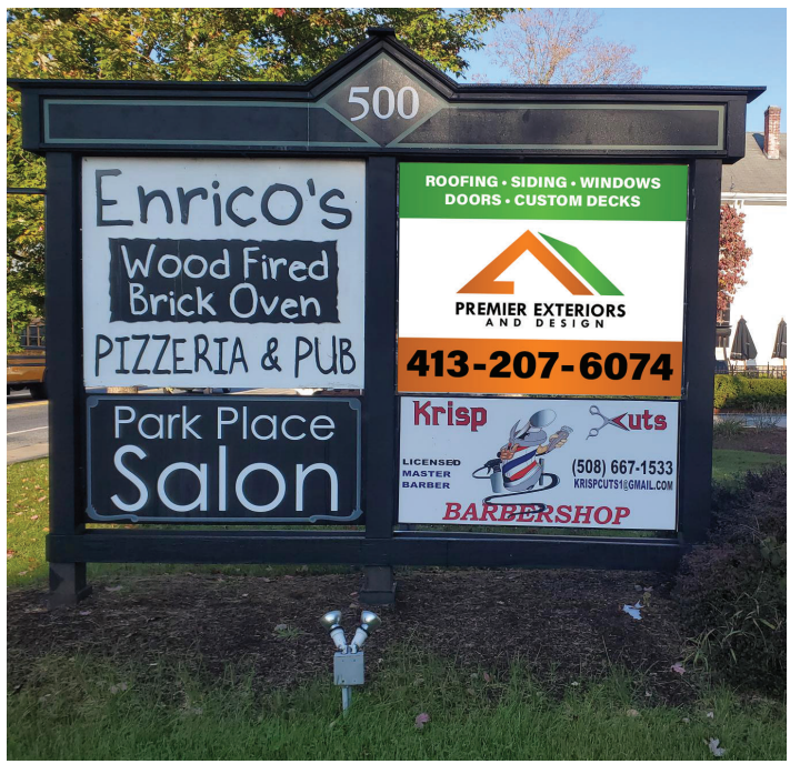
Approximate view of Graphics installed

Printed and Laminated Vinyl Graphics Direct mount to existing double sided tenant panel