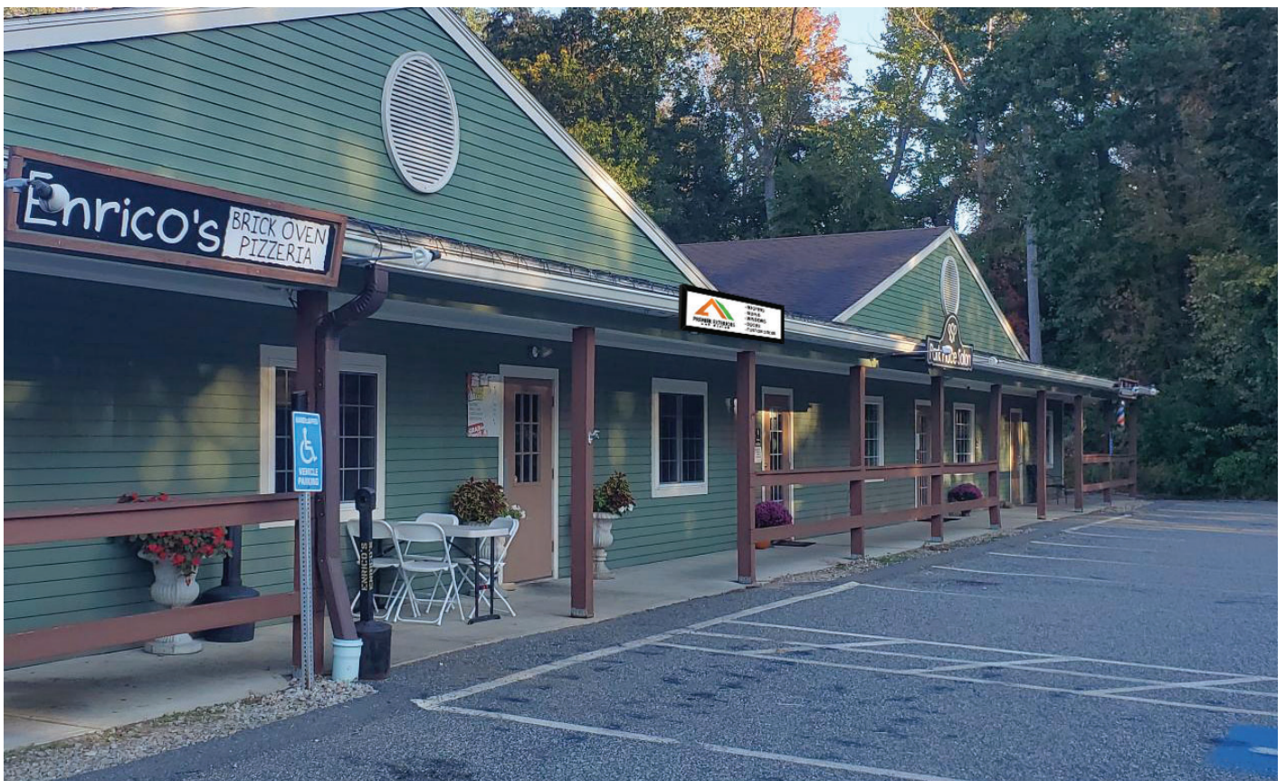
Approximate view of sign installed

1/8in Aluminum composite sign panel with printed and laminated vinyl graphics 1.5" depth aluminum tube frame with black aluminum retainers Mounts to building facade utilizing existing sign bracket and mechanical fasteners