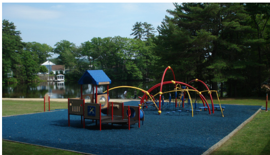
Cedar Lake Recreation Area

In addition to public facilities, there are several privately-owned recreational areas in Sturbridge, including Outdoor World, Yogi Bear Campground, Hamilton Rod and Gun Club, and Hemlock Golf Course. They offer residents and tourists a wide range of activities, including camping, fishing, swimming and picnicking. Wells State Park offers all of these activities and more. For example, at the state-owned park, visitors can enjoy cross country skiing, horseback riding, snowmobiling and hunting. The Westville Recreation Area, owned by the US Army Corp of Engineers, offers similar recreational activities in addition to field sports.