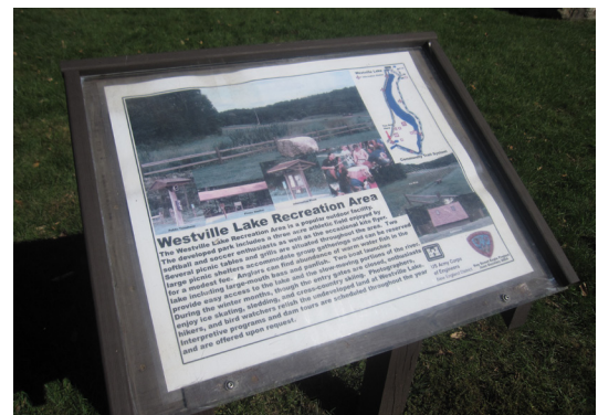
Westville Lake Recreation Area

new multi-purpose field, two basketball courts, a playground and a bocce court at the Town Barn behind the DPW garage facility. A concession stand, restrooms, and parking would also be provided.