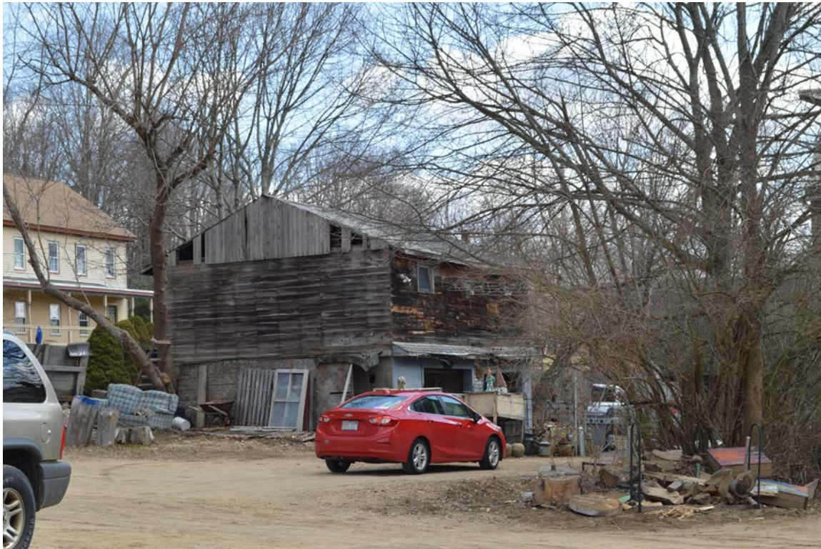
Photo 2. Garage, 552 Main Street, looking southeast.