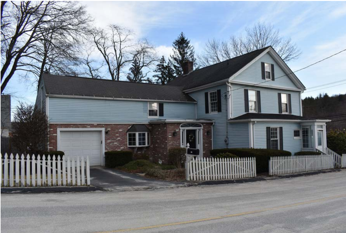
Photo 2. Horatio N. Drake House, looking southeast.