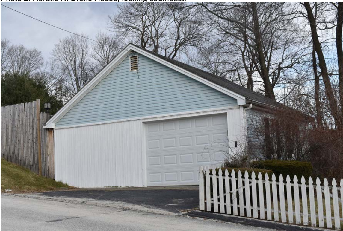
Photo 3. Garage, looking northeast.