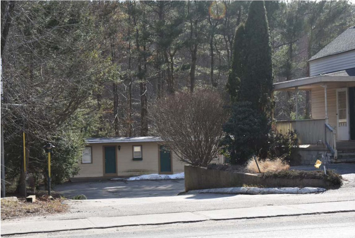
Photo 2. Pink Haven Motel Building 1, 501 Main Street, looking southwest.