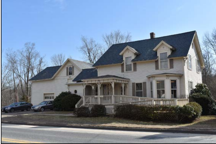
Photo 1. 473 Main Street, looking southeast.