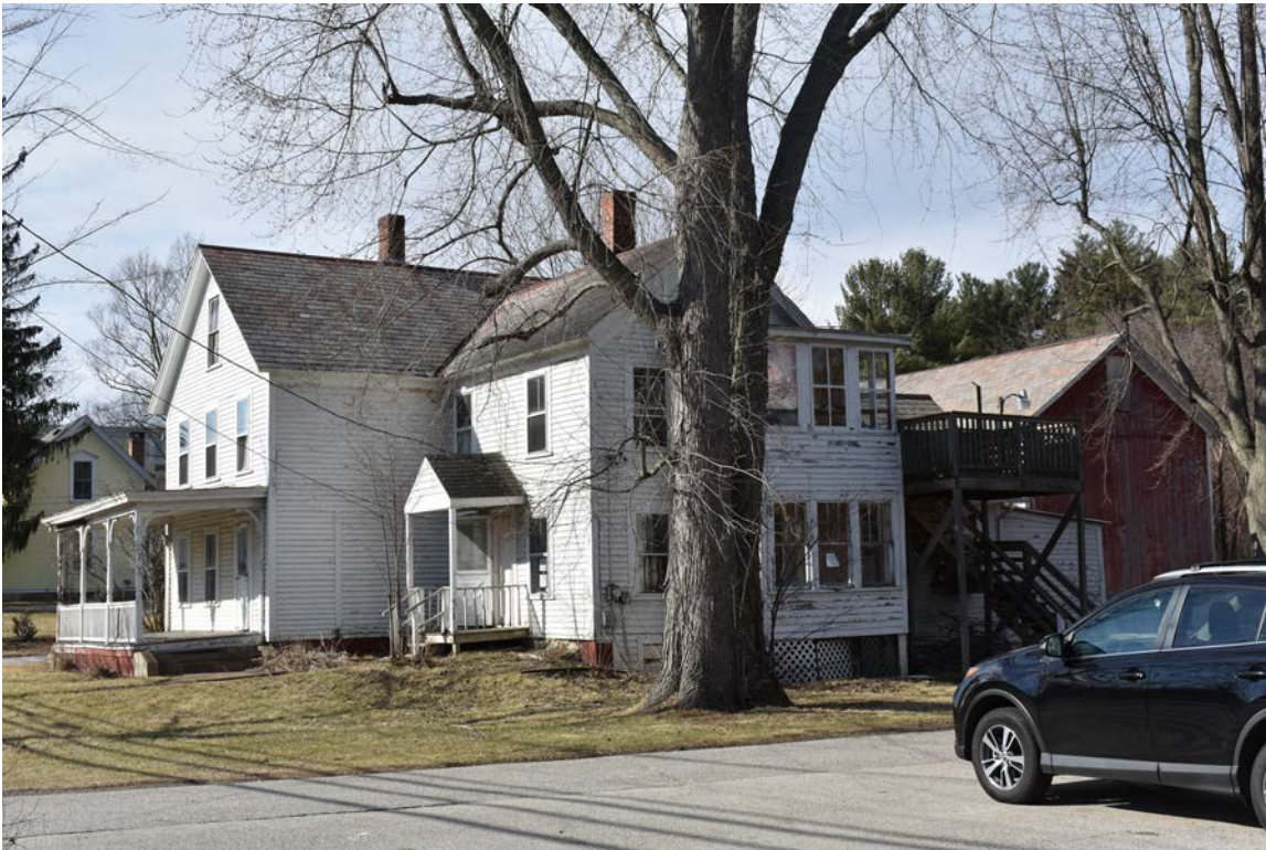
Photo 2.468 Main Street, looking northwest.