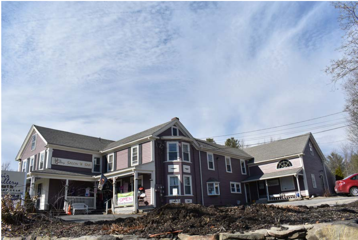
Photo 2. Livingston Shumway House, 454 Main Street, looking northwest.