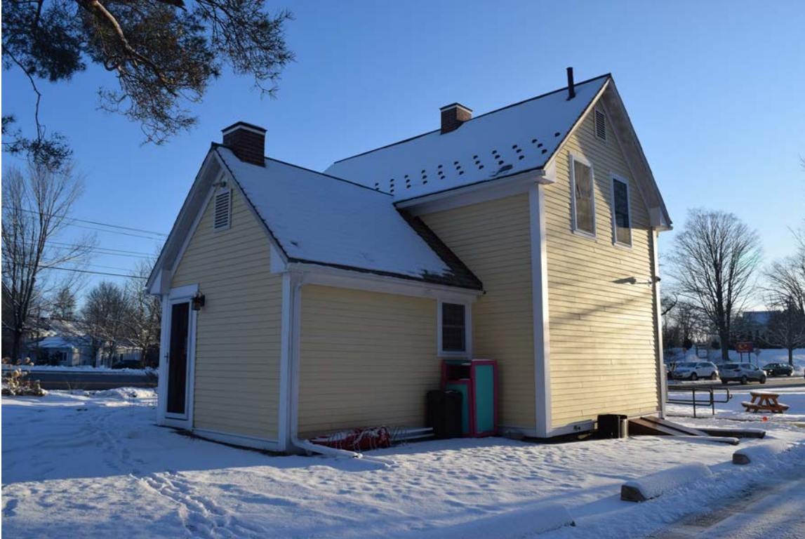
Photo 2. 413 Main Street, looking northeast.