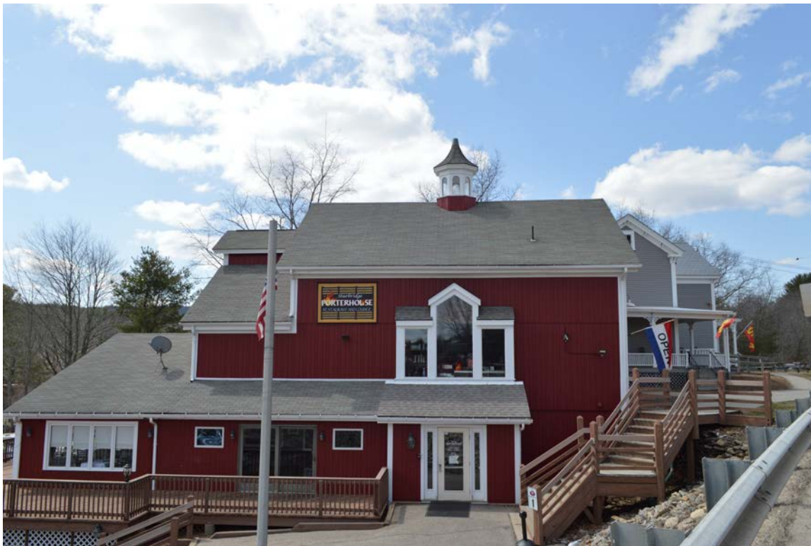
Photo 2. George Richards House, 407 Main Street, looking west.