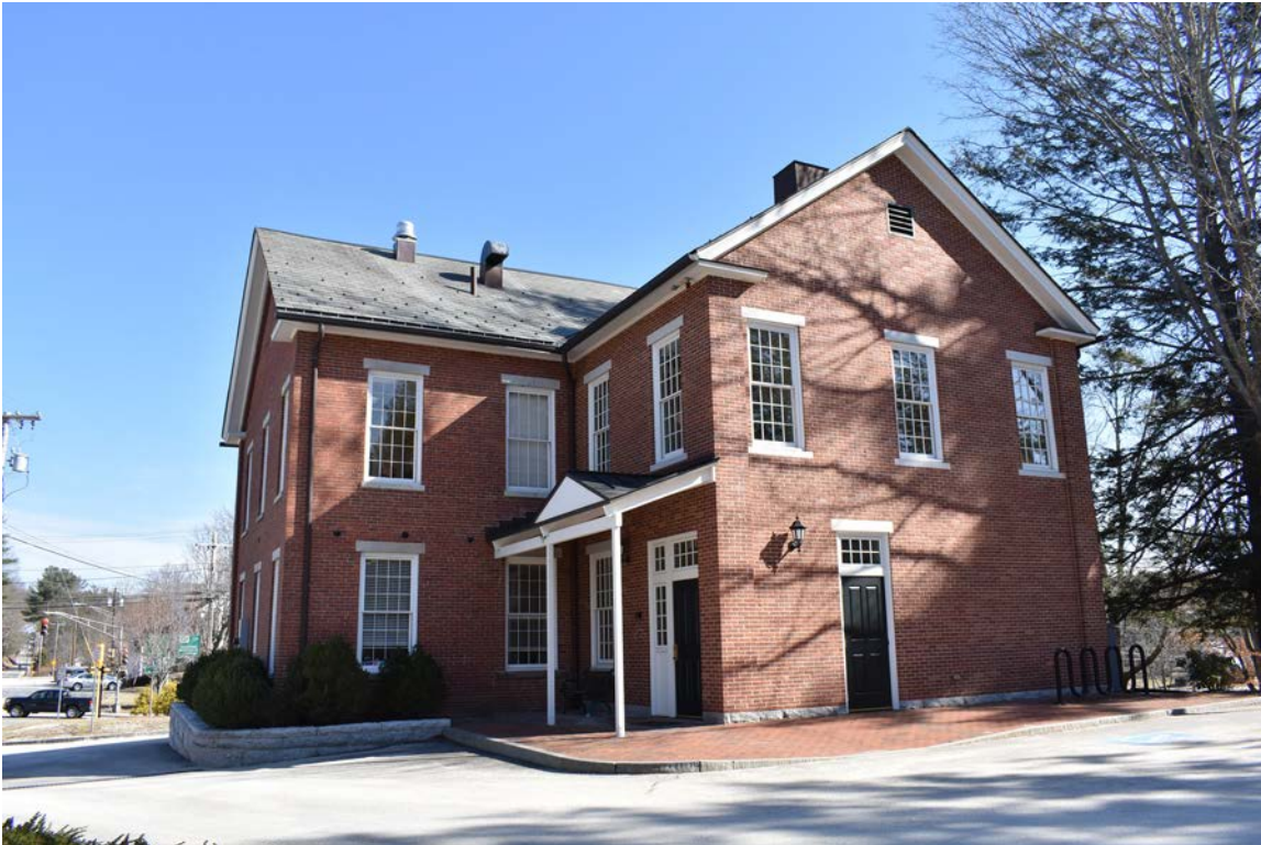
Photo 2. Sturbridge Center School, 301 Main Street, looking northeast at 2011 rear addition.