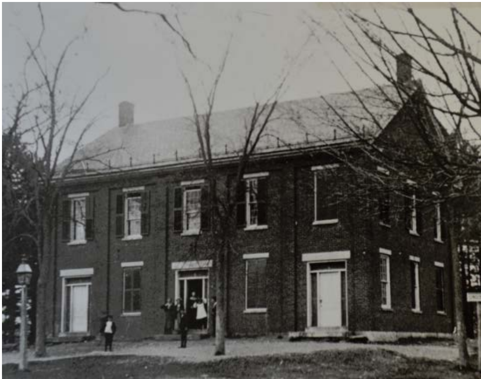
Figure 2. Undated photograph of the Sturbridge Center School.