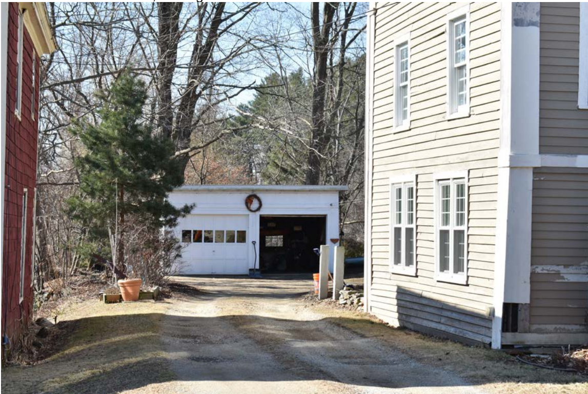
Photo 3. Garage, 269 Main Street, looking southwest.