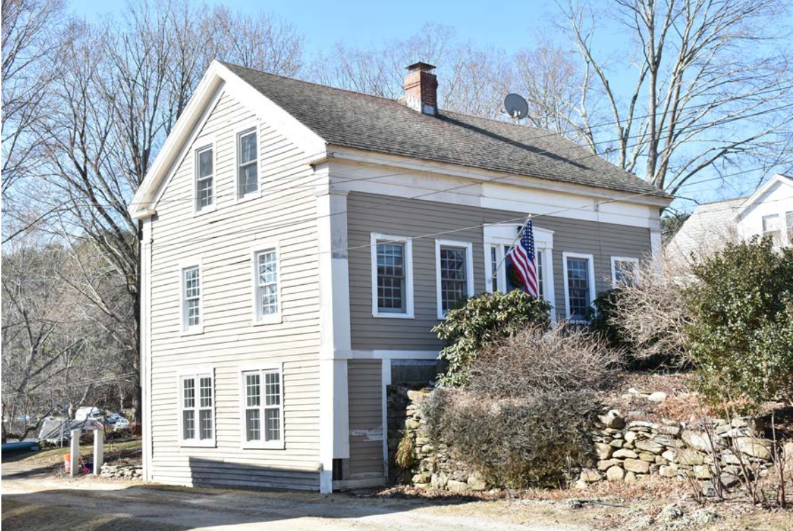
Photo 2. 269 Main Street, looking west.