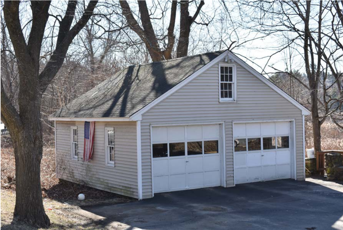
Photo 2. Garage, looking southeast.