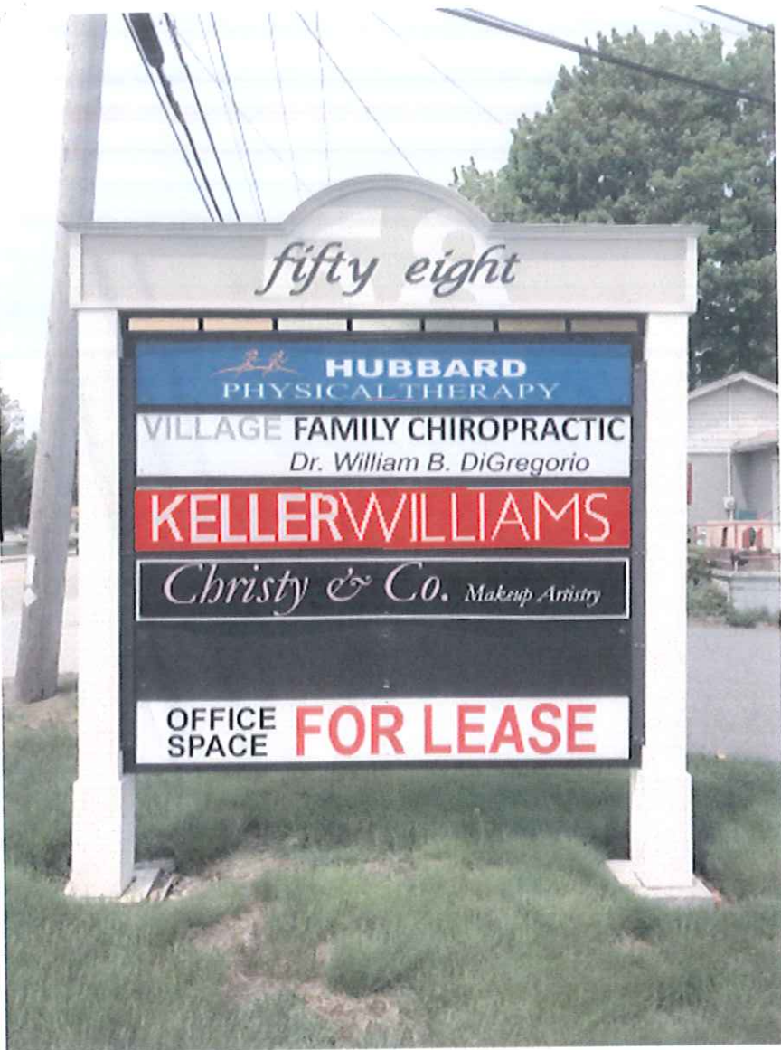
3/4" white PVC with vinyl graphics copy.