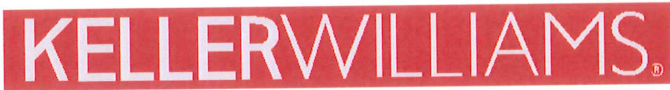
3/4" white PVC with vinyl graphics copy.