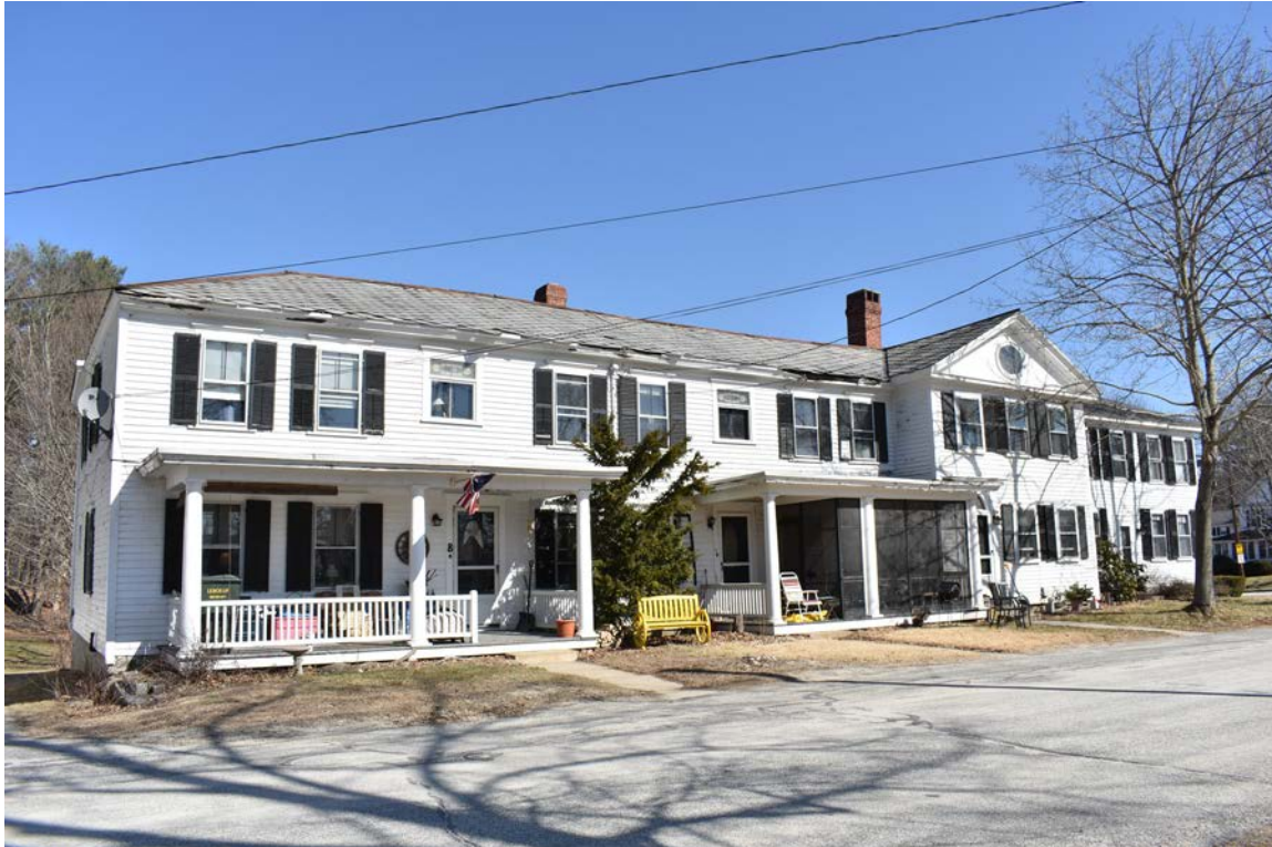
Photo 2. Jared Lamb Building, 2-8 Chamberlain Avenue, looking northeast.