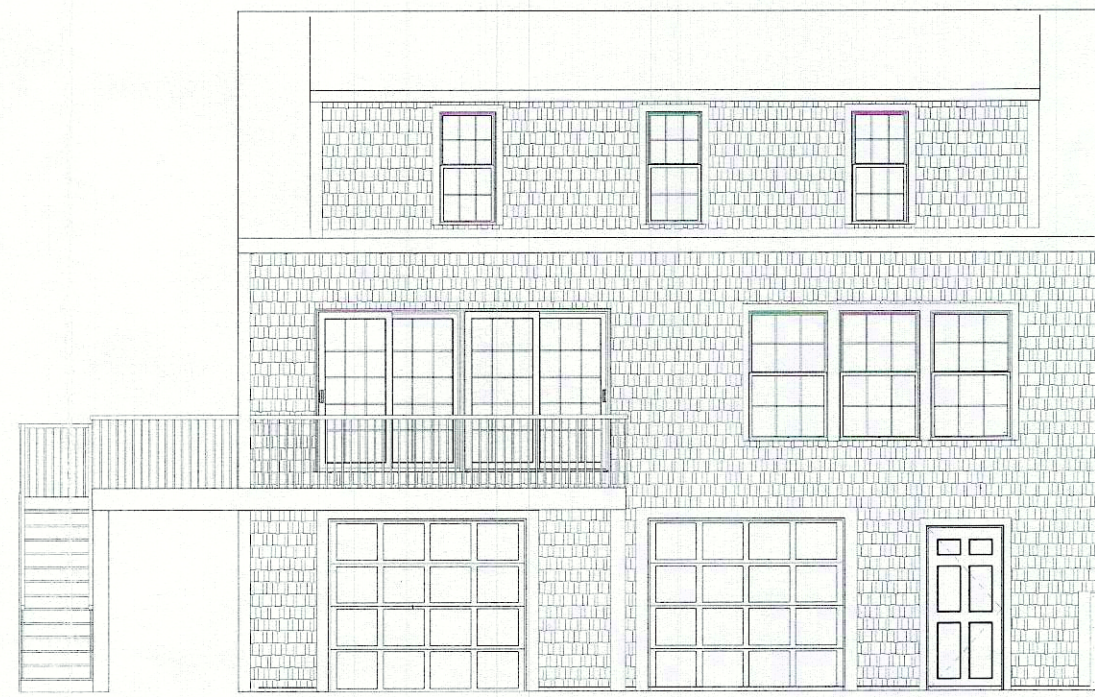
3 South 1/4" = 1'-0"