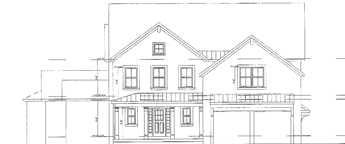
NORTH ELEVATION SCALE: 1/4" = 1'-0"

© 2012 KEMPER ASSOCIATES ARCHITECTS, LLC ALL RIGHTS RESERVED. THIS DOCUMENT IS THE PROPERTY OF KEMPER ASSOCIATES ARCHITECTS, LLC. NO PART OF THIS DOCUMENT MAY BE REPRODUCED OR TRANSMITTED IN ANY FORM OR BY ANY MEANS, ELECTRONIC OR MECHANICAL, WITHOUT THE WRITTEN PERMISSION OF KEMPER ASSOCIATES ARCHITECTS, LLC.