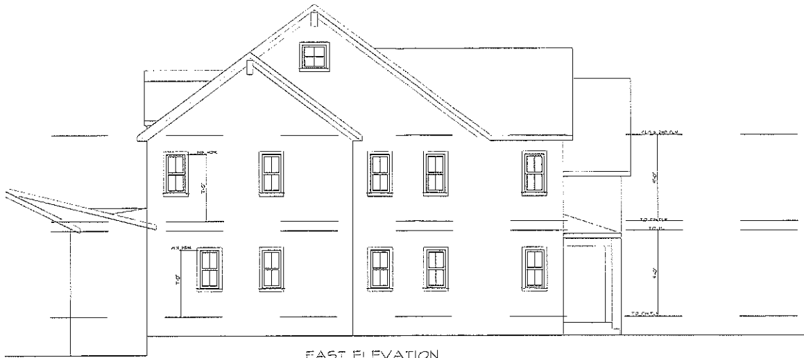
EAST ELEVATION SCALE: 1/4" = 1'-0"