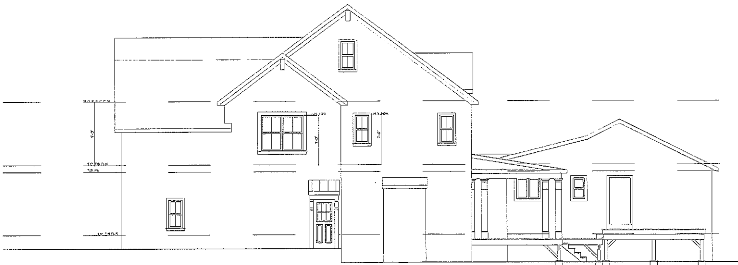
WEST ELEVATION SCALE: 1/4" = 1'-0"

Kemper Associates Architects LLC 100 Haverhill Street, Suite 100, Haverhill, MA 01830 Tel: 978.375.1100 Fax: 978.375.1101 www.kemperassociates.com