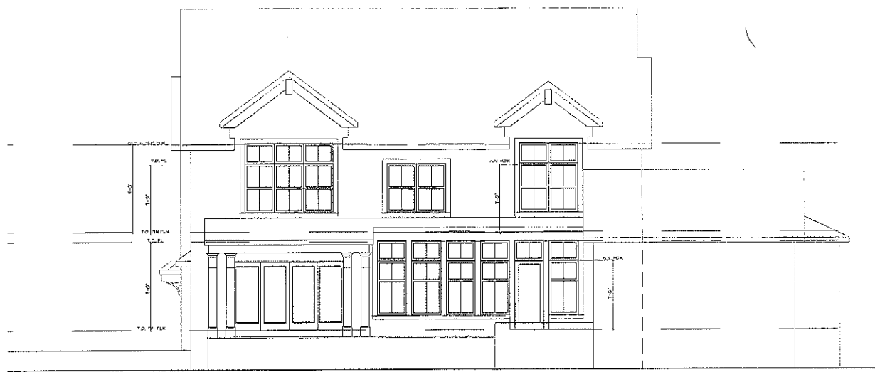
SOUTH ELEVATION SCALE: 1/4" = 1'-0"