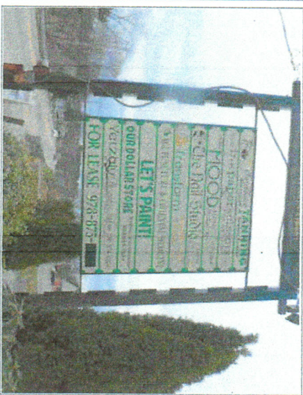
Existing Sign Dimensions: 8-1/2" h x 81-1/2" w

*NOTE: Your approval of the Brandbook indicates your acceptance that the signage, provided to you and owned by Allstate, will be manufactured and installed as shown, pending landlord and/or municipality approval. Once accepted, signage may not be declined at time of installation for any reason other than a manufacturing defect. Any Allstate-branded items that we install are the property of Allstate.