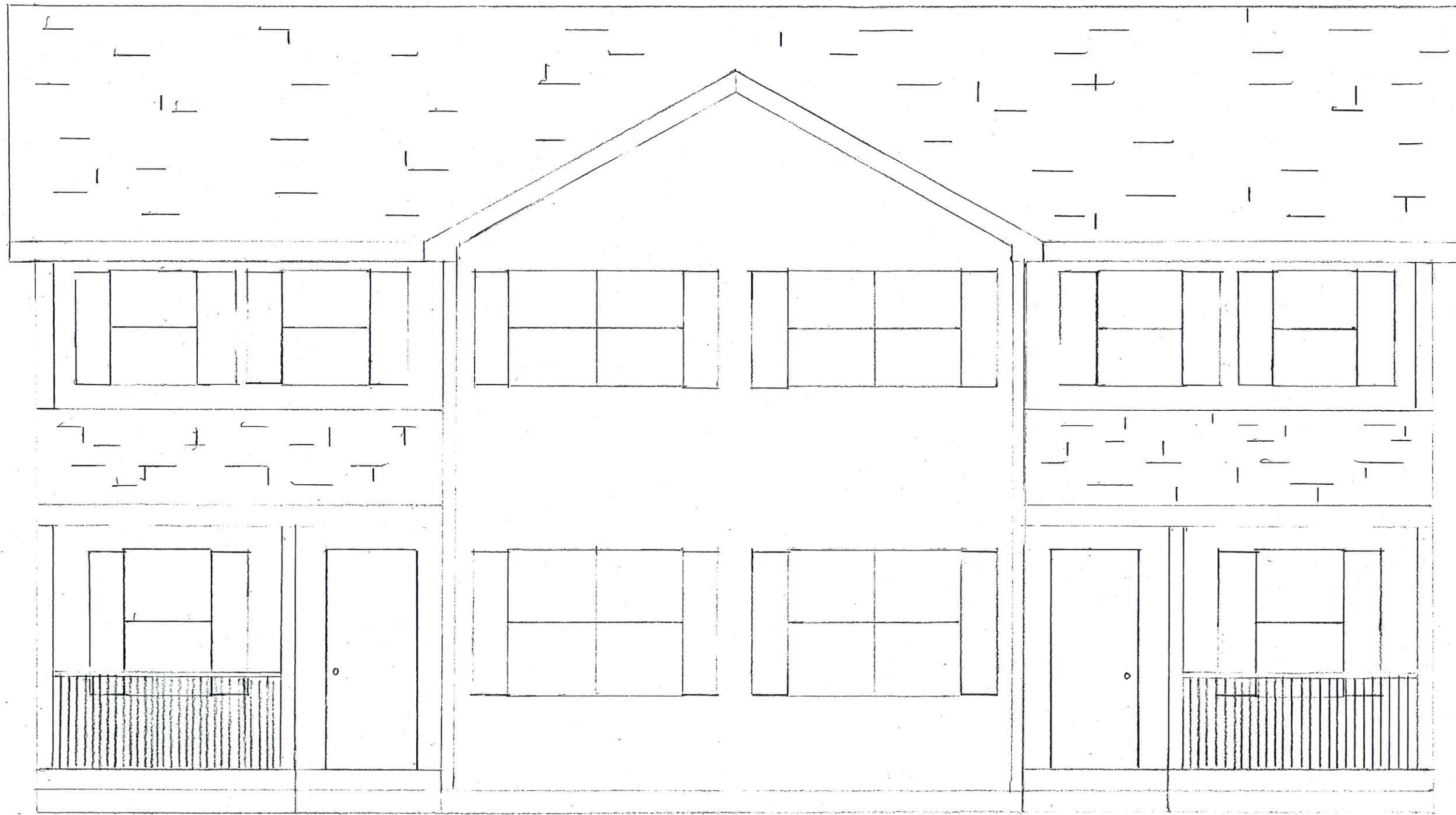
FRONT ELEVATION 1/4" = 1'-0"