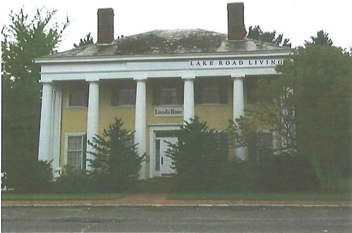
12"x168" wood panel, Navy Blue on White