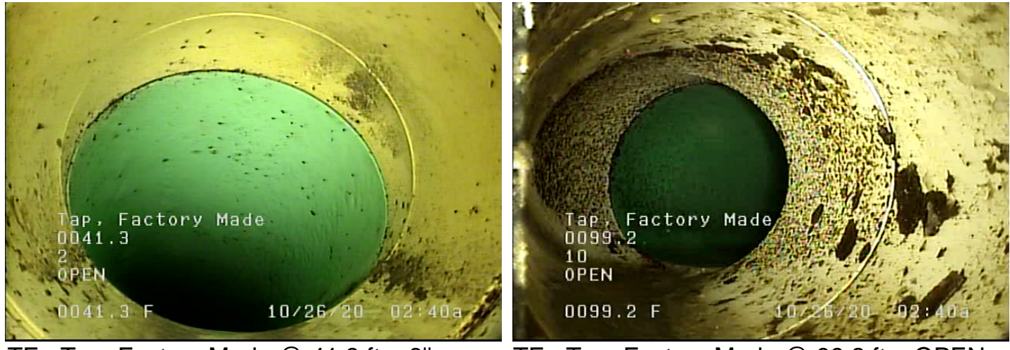
TF - Tap, Factory Made @ 41.3 ft. 6" WYE 15" TO COVER JOINT IN MAIN