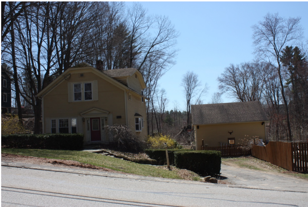
Photo 1: Northern facing main façade and northern side elevation of barn outbuilding

Wilkin, Agnes S. "10 Whittemore Road," (MHC Inventory #STU.63), 1973. http://mhc-macris.net/Details.aspx?MhcId=STU.63 , accessed November, 2017.