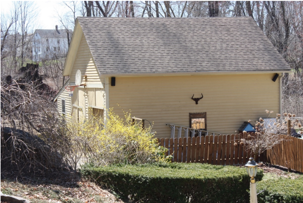
Photo 5: Eastern façade and northern side elevation of outbuilding