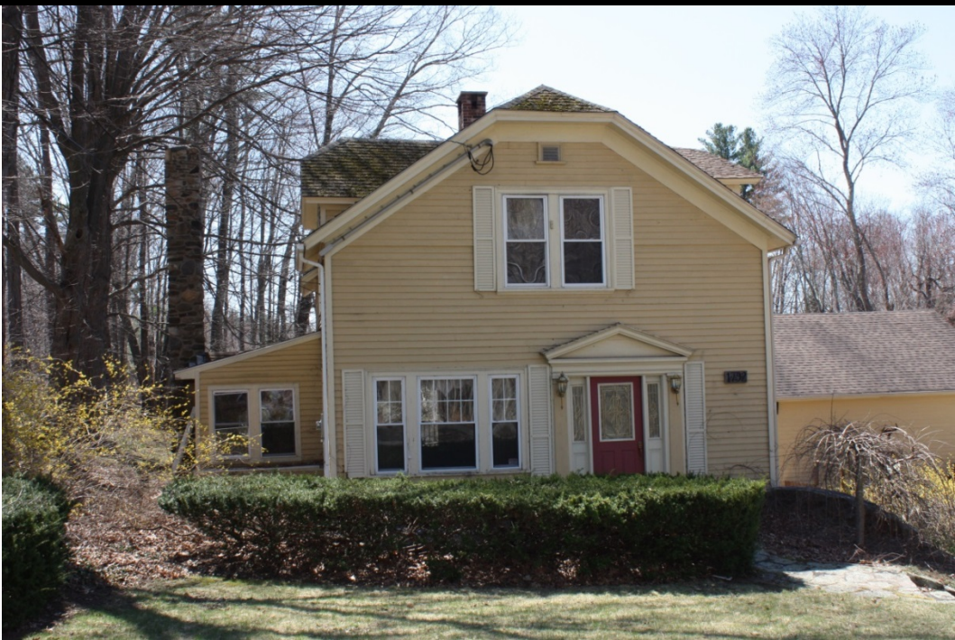
Photo 2: Closer perspective, northern facing main façade of residence