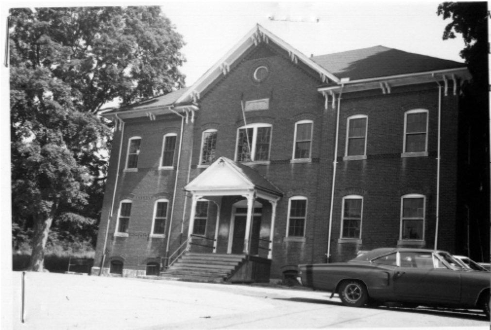
Figure 2: 1973 exterior photo