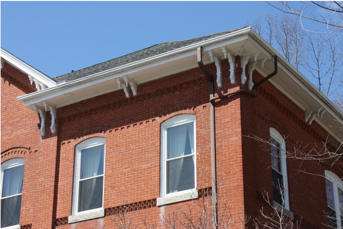
Photo 3: Bracketed cornice and roof eave detailing, southern facing main façade