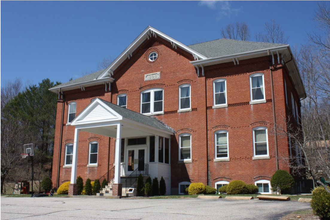
Photo 1: Southern facing main façade and glimpse of eastern side elevation

Figure 2: Holley, Helen G. "8 School Street" (MHC Inventory Form # STU.165), 1973. http://mhc-macris.net/Details.aspx?MhclId=STU.165 , accessed July 2017.