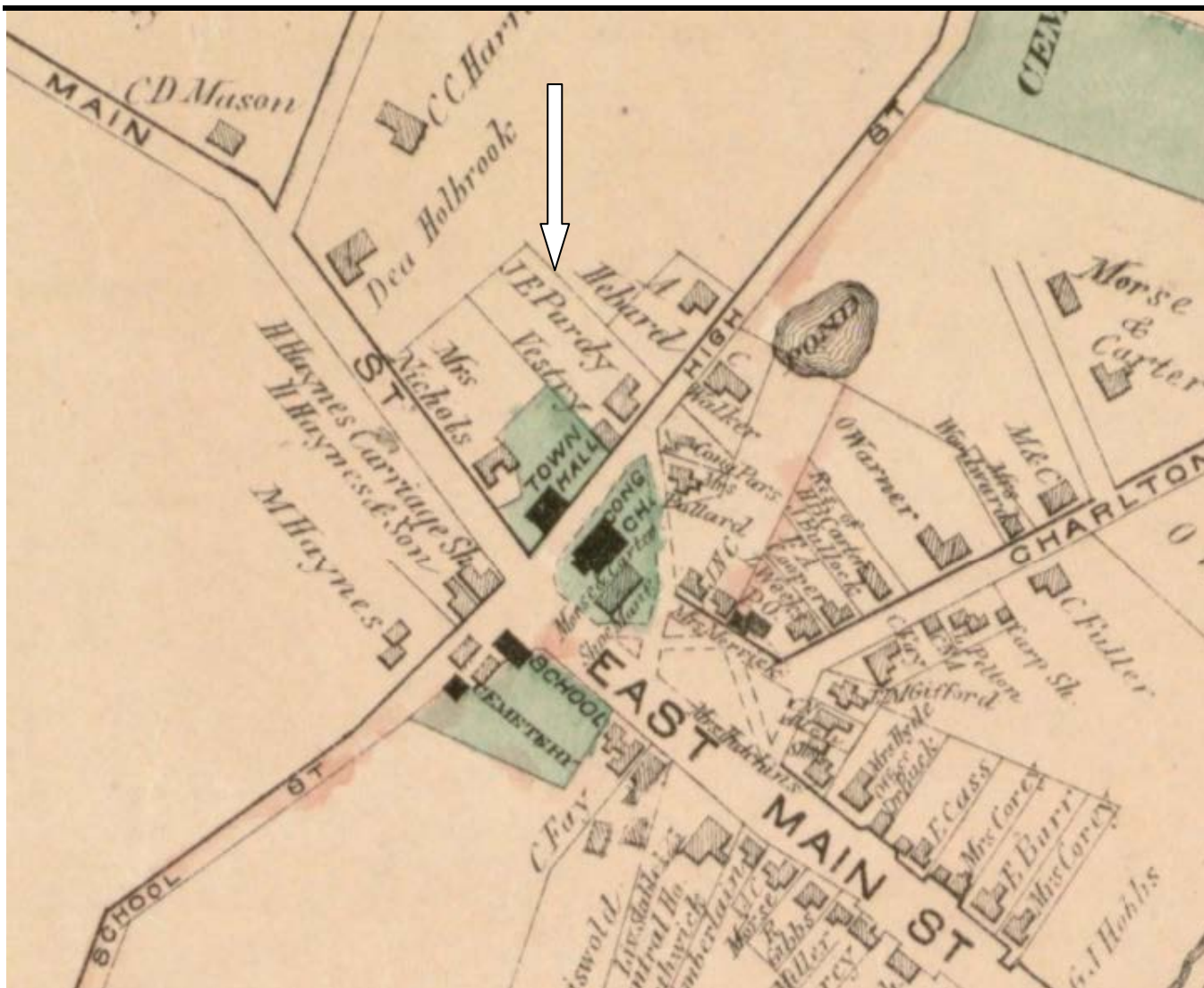
Figure 1: 1870 Map showing J. E. Purdy's property on High Street (later Maple Street)