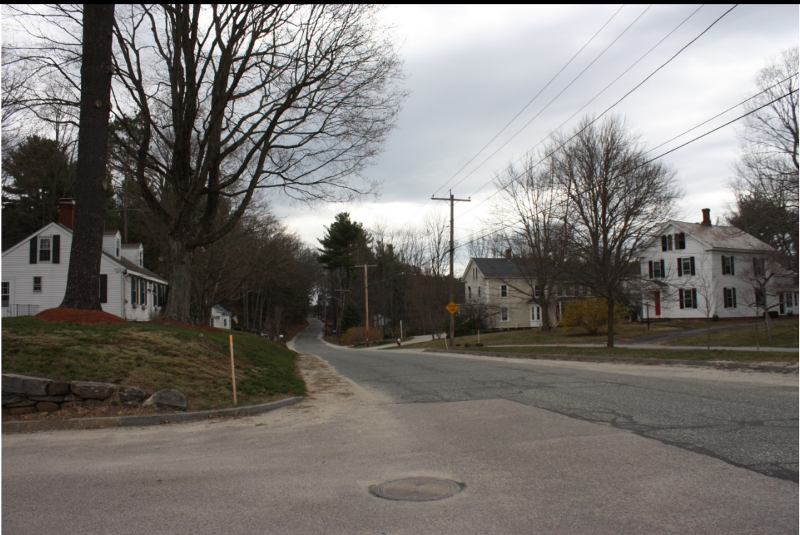
Photo 1: Maple Street streetscape, 9 Maple Street on left, camera facing north