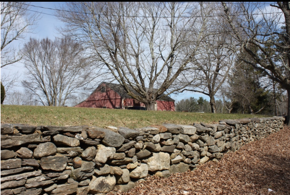
Photo 3: Stone wall along Fiske Hill Road and barn outbuilding to the north