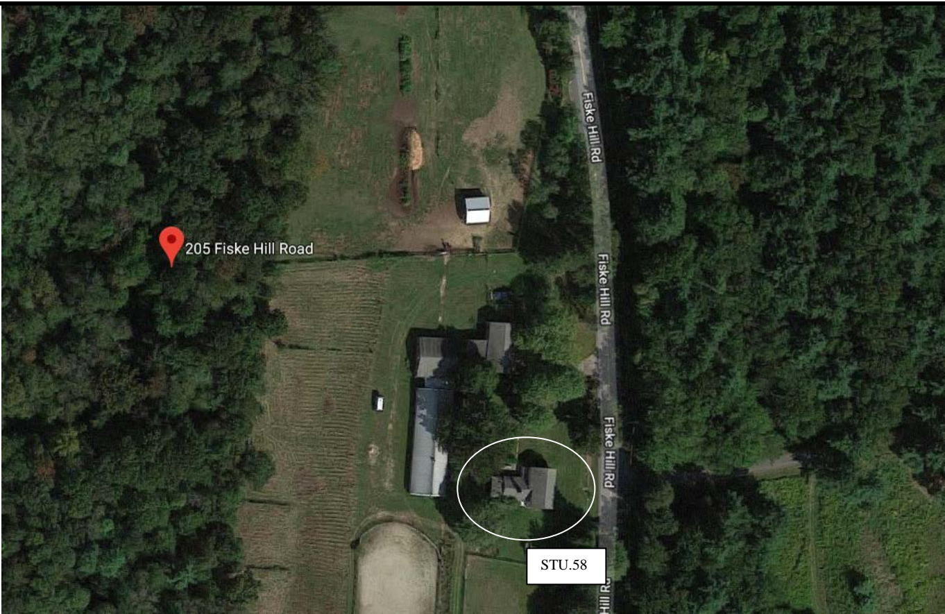
Figure 4: Twenty first century aerial perspective showing residence (circled) and outbuildings