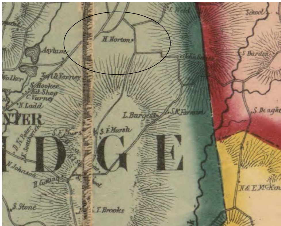
Figure 1: 1857 Map (H. Horton)