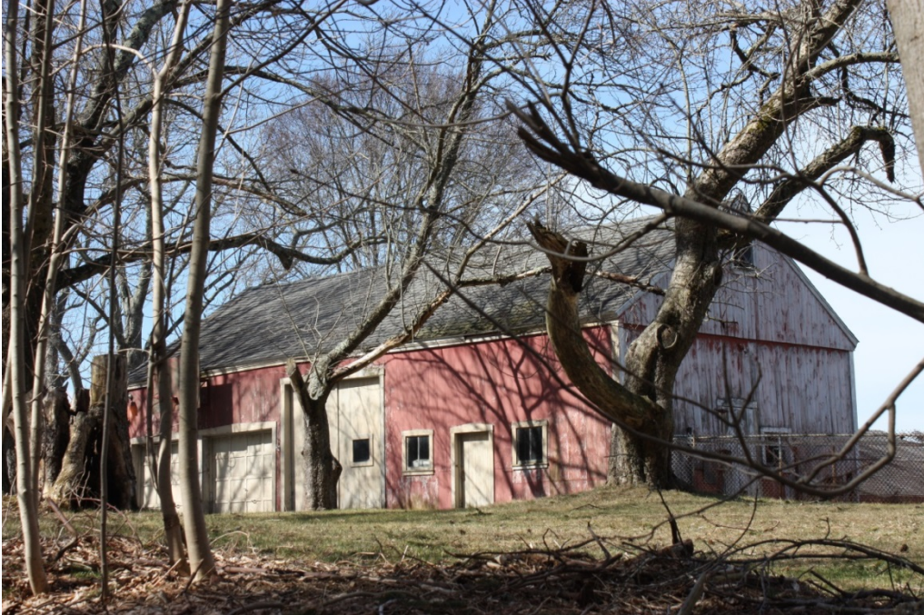
Photo 4: Eastern facing façade and northern elevation of barn outbuilding