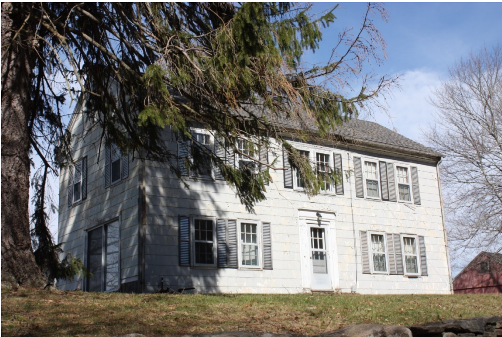
Photo 2: Eastern facing façade and southern side elevation. Barn outbuilding visible to the north.