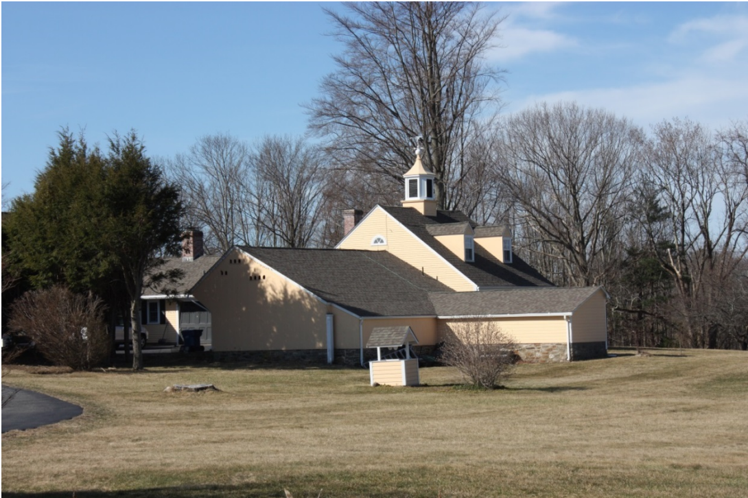
Photo 4: Southern facing outbuilding, view of eastern side elevation