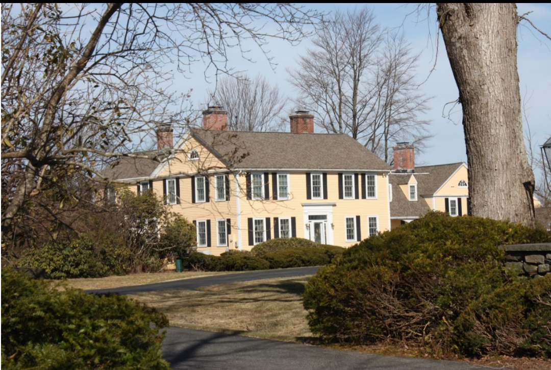
Photo 1: Eastern facing main façade, showing older portion of the building