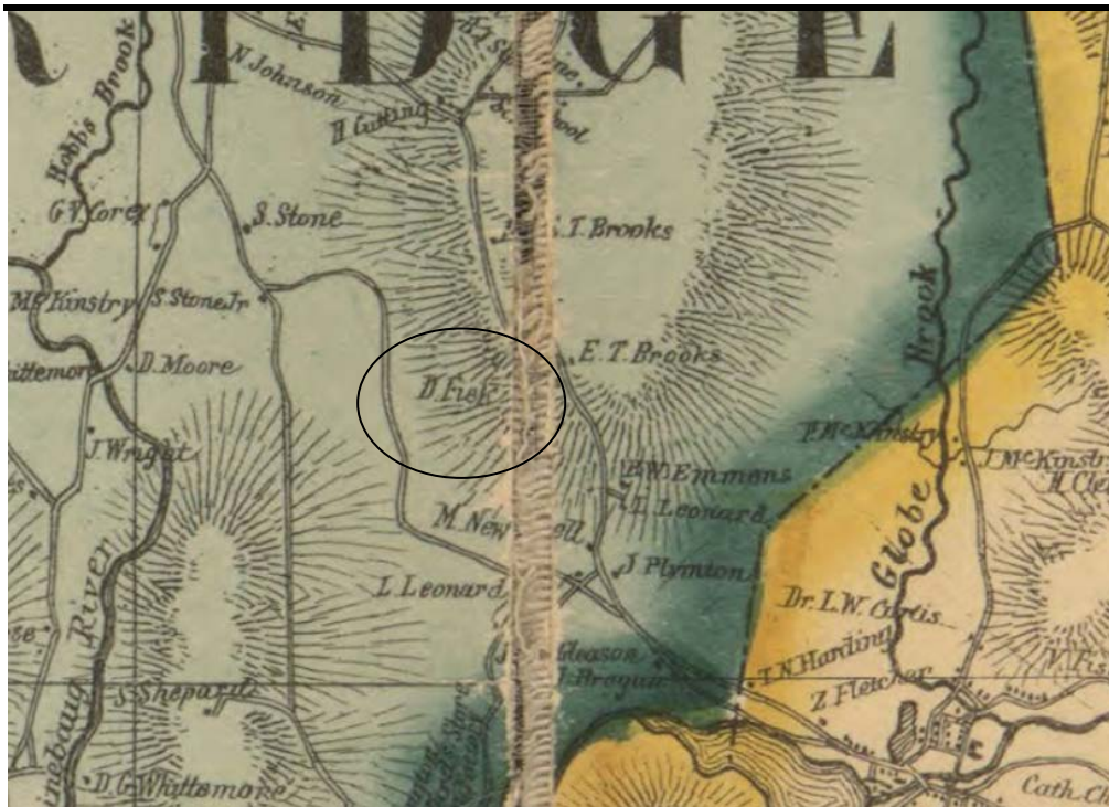
Figure 1: 1857 Map