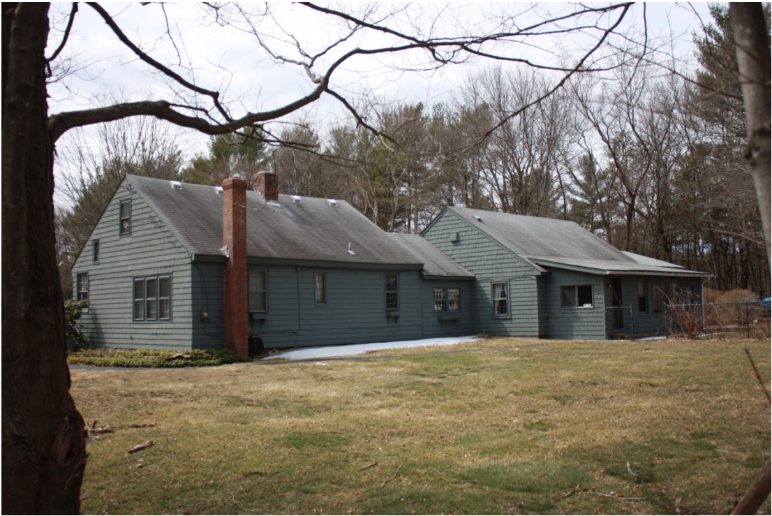
EAST AND NORTH ELEVATIONS